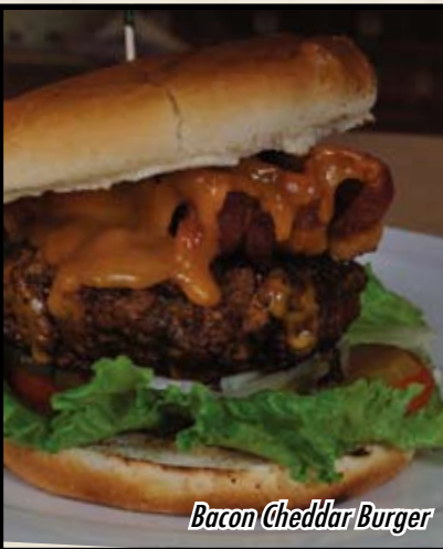
Bacon Cheddar Burger

Our Garlic and Herb crusted Tilapia, lettuce, tomato, cheddar cheese and Haus made tartar sauce