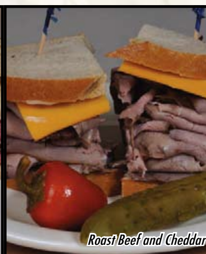
Roast Beef and Cheddar

Choose your bread: Rye Bread, Sweet Sourdough, Ciabatta or Wheat Bread.