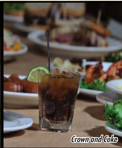
Crown and Coke