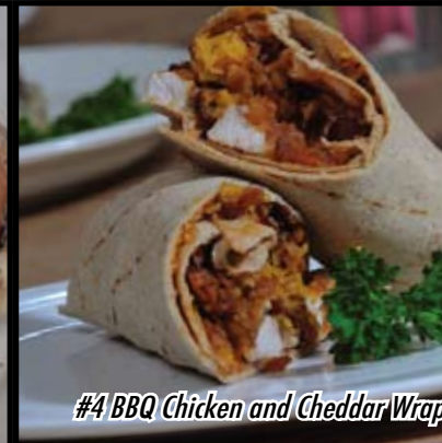
#4 BBQ Chicken and Cheddar Wrap