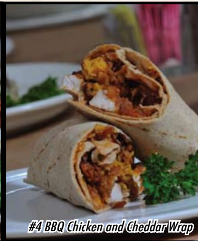
#4 BBQ Chicken and Cheddar Wrap