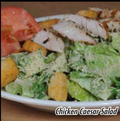
Chicken Caesar Salad

Fried or Pan-Seared boneless filet, lightly seasoned with garlic and herbs 9.99