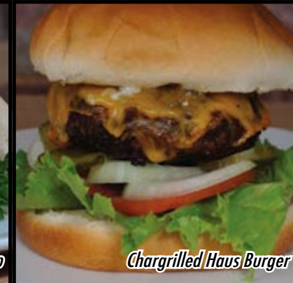
Chargrilled Haus Burger