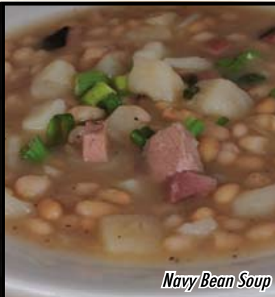
Navy Bean Soup