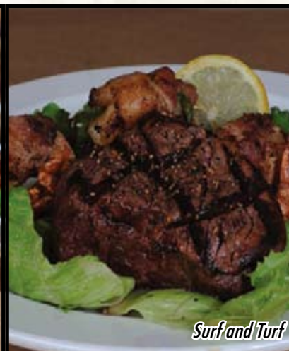
Surf and Turf